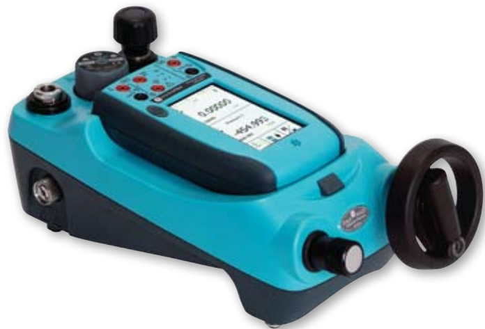
Re-rangeable pressure measurement and generation from 25 mbar (10 inH 2 O) to 1000 bar (15000 psi)