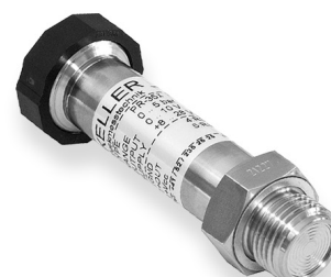
Series 35 X G1/2", flush diaphragm