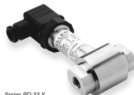
Series PD-33 X